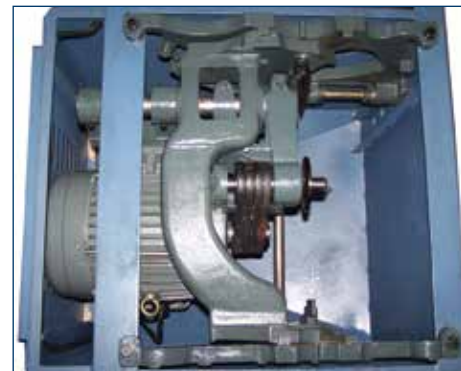
MASSIVE, WELL DESIGNED trunnion assembly.