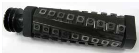
STANDARD helical cutterhead with GERMAN CARBIDE inserts is included with jointer.

RACK & PINION FENCE assembly gives superior support and adjustments