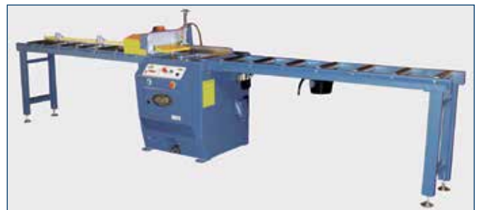
SHOWN WITH optional 6' roller table assembly.