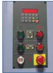
DIGITAL CONTROLS allow for accurate and quick thickness settings.