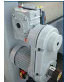
POWERFUL VARIABLE speed drive with reduction gear box.