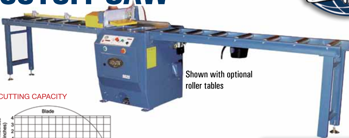
Shown with optional roller tables