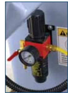
ADJUSTABLE air pressure inlet.