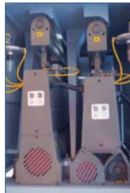
HEAVY DUTY double head configuration.