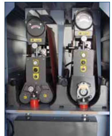
HEAVY DUTY double head configuration.